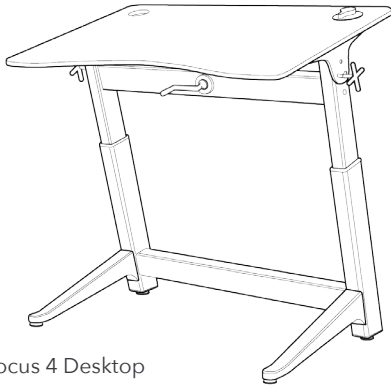
Locus 4 Desktop